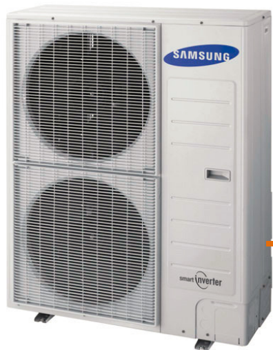
5 ton ECO VRF AM053FXMDCH/AA