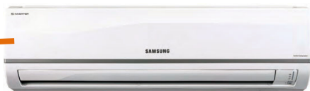
1 ton Wall Unit AM012FNQDCH/AA