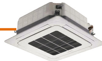
3/4 ton Mini 4 way AM009FNNDCH/AA