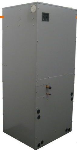
3 ton Vertical AM036GNVQCH